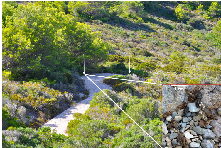
Fig. 2 The scat pile found in Cabrera Island. White arrows indicate the limits of the narrow scat pile (see dimensions in the text). Behind the left turn of the track, we can see a slope densely covered by malacophyllous shrubs, including Juniperus phoenicea . On the lower right corner, a detail of the accumulation of faeces, with 16 scats in a very reduced area

diet description because of the use of small sample sizes and a limited geographical coverage present in previous studies [15].